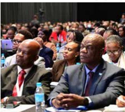
3 DAY MULTI-TRACK STRATEGIC CONFERENCE