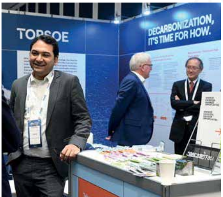
3 DAY EXHIBITION