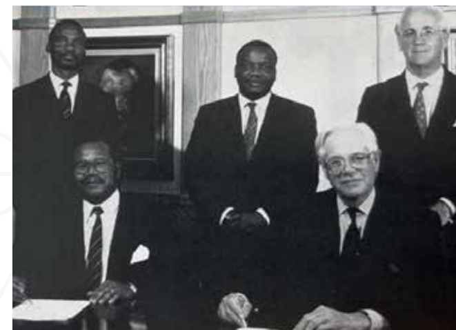
THE PAST AND PRESENT

Botswana's mining sector has established itself as one of the most lucrative in the world, with its modern-day mining industry beginning in the early 1970s. Initially focused on diamonds and copper-nickel, the country's mining landscape has since expanded to include a diverse range of minerals, including silver, soda ash, salt, coal, and gold.